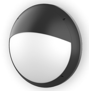
D30 Bulkhead with Eyelid accessory